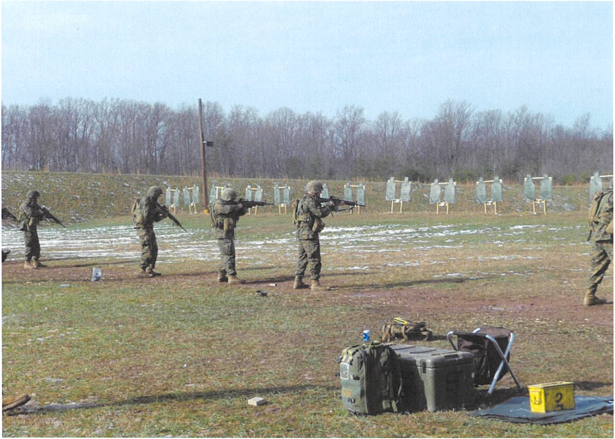
Range 2 Short Range Targetry (100 yard line).