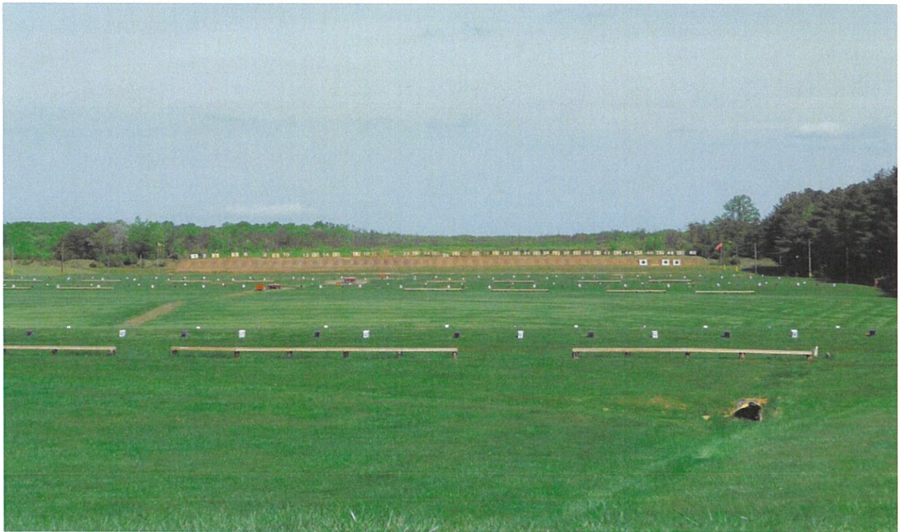
Range 2 600 yard line.

**WTBN S-3 will notify FBI Academy Ranges/COC of the event prior to execution.